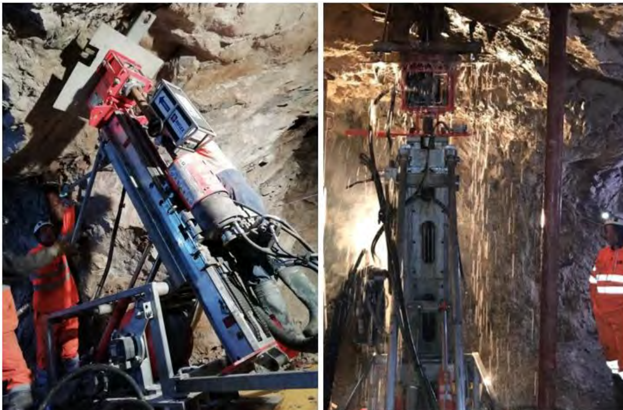
Figure 1: Underground drilling underway at the Pian Bracca zone